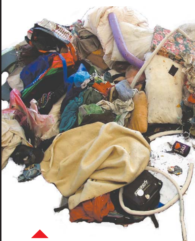
CONTAMINATION Some clothing and fabrics found in recycling (yellow) bin

For more information on your waste services contact the Coffs Coast Waste Services Hotline on 1800 265 495 or visit the website: www.handybinwaste.com.au